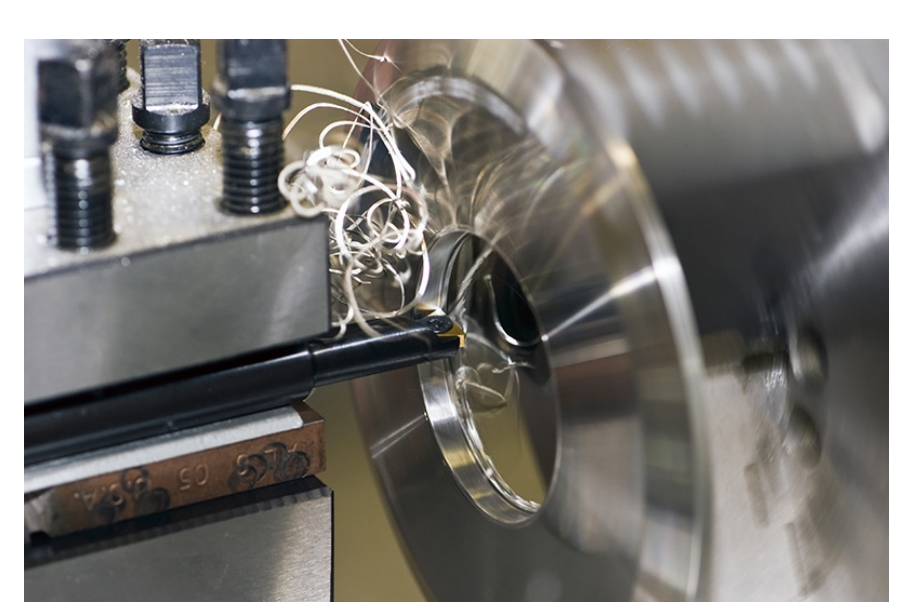
Semi-Synthetic Coolants High Oil, Less Irritating

Supercool #3000 semi-synthetic coolant concentrates are designed for machining ferrous and nonferrous metals over the entire machining spectrum.